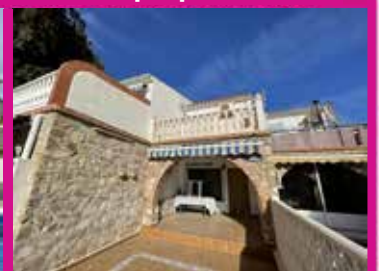
Puerto de Mazarron. ref. 2014. 2014. 2bed, 2 bath terraced villa, walk to beach, private parking. 120 ,000€