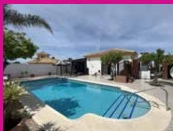
Mazarron country Club.ref. 2022. 2 bed, 2 bath, detached villa, private pool, parking. 169,000€