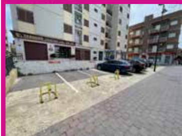
Puerto de Mazarron. ref. 2018. 2018. 4 bed,2 bath apartment, 95m2 build, 100mtrs from the Marina. 99,000€

Please visit our website to find 360° virtual walkthrough tours with interactive floorplans for most of our properties