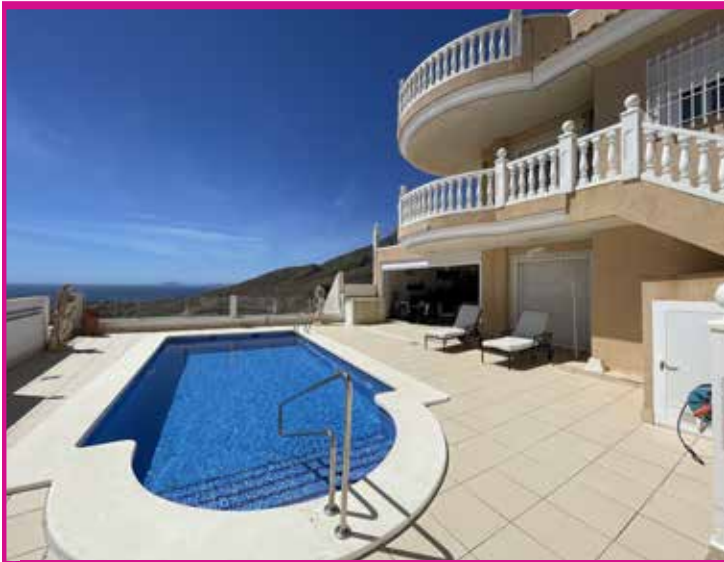
Bolnuevo.ref. 2015. 6bed 7bath detached villa, 422m2 build, 616m2 plot, amazing sea and mountain views, private pool. 749,000€