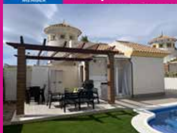
Mazarron Country Club. ref. 2012. 2 bed,1 bath, detached villa, 300m2 plot,private pool, parking, 155,000€